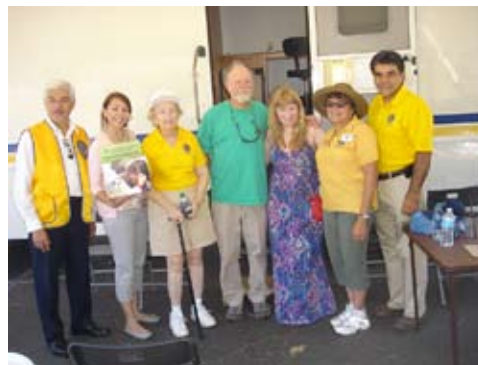
L.A. Host Lions with representatives from Dolores Mission School and Church and Lions from Central City Boyle Heights Lions.